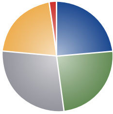
REVENUE Year ending 12/31/23