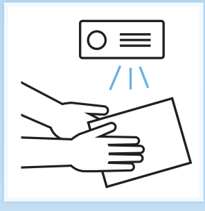
Dry hands with a clean towel or air dry your hands