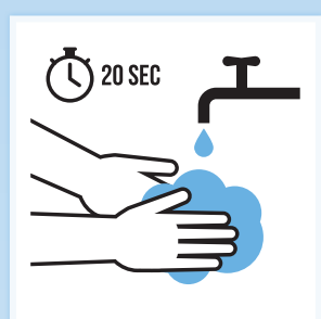
Wash hands often with water and soap (20 seconds or longer)