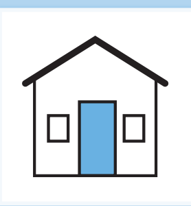
Stay home when you are sick

The Ohio Department of Health offers these helpful precautions to protect yourself and others from the spread of Coronavirus.