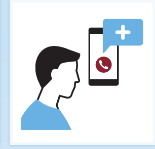
Call before visiting your doctor